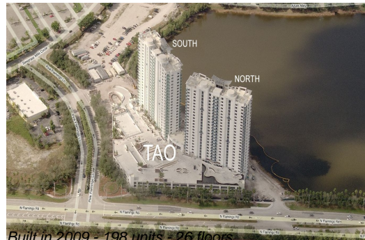
Built in 2009 - 198 units - 26 floors