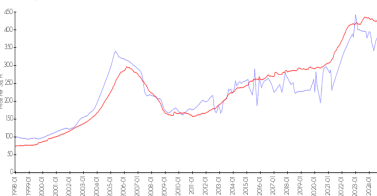
Quadomain Britannia vs Hollywood Beach