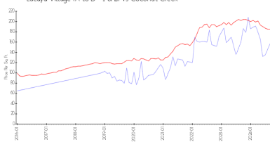
Lucaya Village (A to D - 1 & 2) vs Coconut Creek