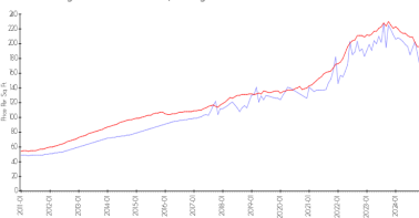
Buckingham East at Century Village vs Pembroke Pines