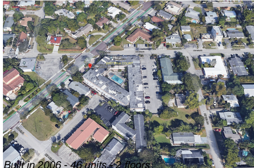
Built in 2006 - 46 units - 2 floors