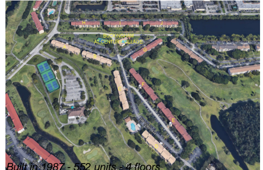
Built in 1987 - 552 units - 2 floors