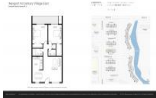
Built in 1974/1978 - 796 units - 2 floors

The above valuated price is a baseline figure that does not take into account any specific renovation, upgrade, split, merge, or deterioration of the unit.