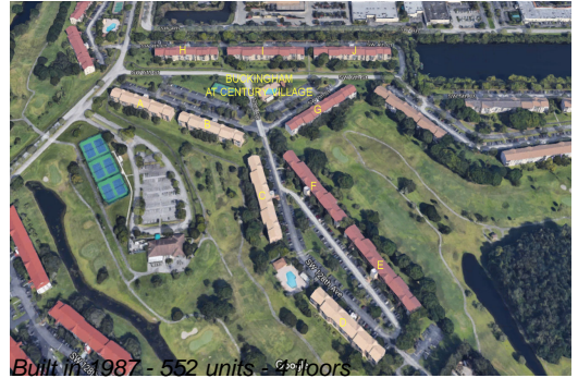
Built in 1987 - 552 units - 9 th floors