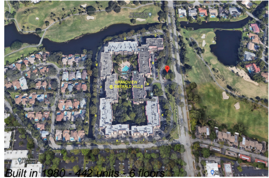
Built in 1980 - 442 units, 6 floors