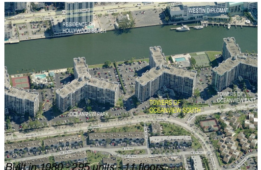
Built in 1980 - 295 units - 11 floors