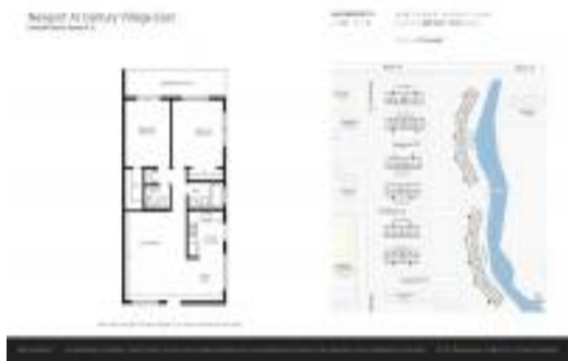
Built in 1974/1978 - 796 units - 2 floors

The above valuated price is a baseline figure that does not take into account any specific renovation, upgrade, split, merge, or deterioration of the unit.