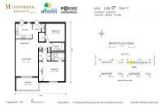
Built in 1973 - 56 units - 7 floors

The above valuated price is a baseline figure that does not take into account any specific renovation, upgrade, split, merge, or deterioration of the unit.