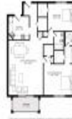
MODEL UNIT OF FINISHES