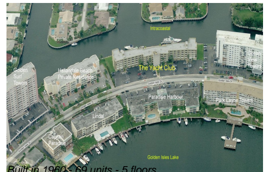
Built in 1960 - 69 units - 5 floors