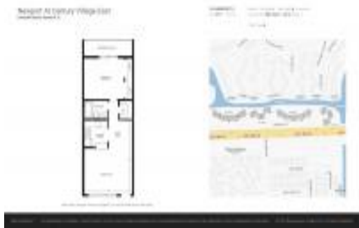
Built in 1974/1978 - 796 units - 2 floors

The above valuated price is a baseline figure that does not take into account any specific renovation, upgrade, split, merge, or deterioration of the unit.