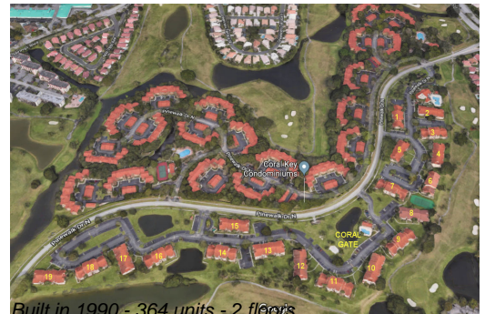
Built in 1990 - 364 units - 2 floors