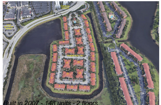
Built in 2007 - 148 units - 2 floors