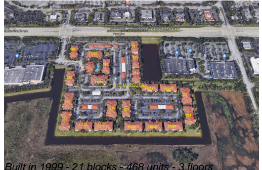
Built in 1999 - 21 blocks ~468 units - 3 floors