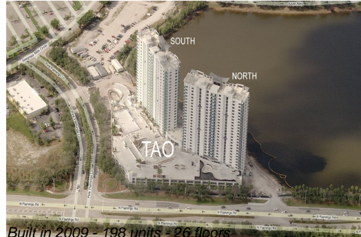
Built in 2009 - 198 units - 26 floors