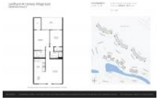
Built in 1974/1977 - 480 units - 4 floors

MLS Number: A11661533 Status: Active Size: 1,000 Sq ft. Bedrooms: 2 Full Bathrooms: 2 Half Bathrooms: Parking Spaces: 1 Space,Assigned Parking,Guest Parking View: List Price: $175,000 List PPSF: $175 Valuated Price: $177,000 Valuated PPSF: $177