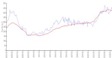
Residences on Hollywood East vs Hollywood Beach