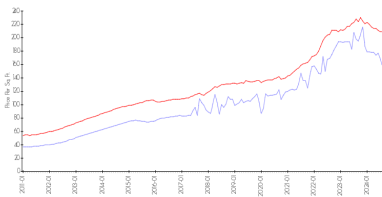
New Hampton at Century Village (K-U) vs Pembroke Pines