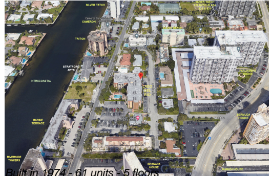
Built in 1974 - 61 units - 5 floors