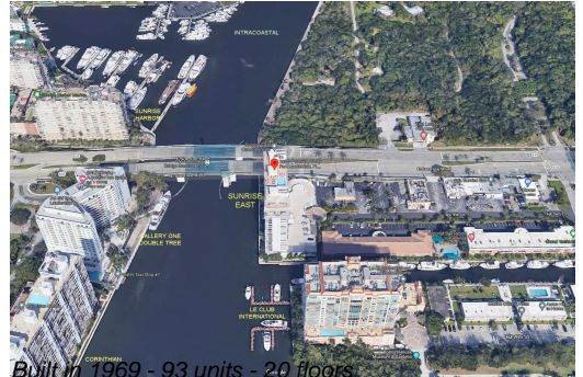
Built in 1969 - 93 units - 20 floors