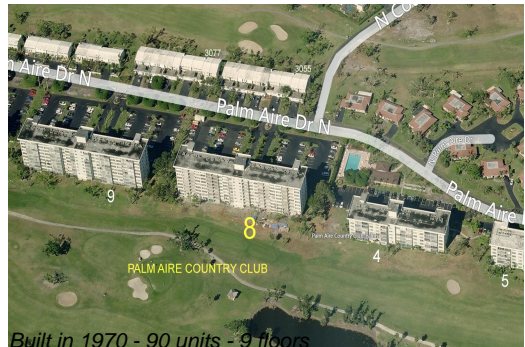
Built in 1970 - 90 units - 9 floors