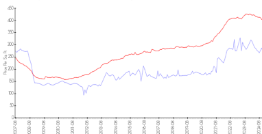
Hollywood Station Condos vs Hollywood Beach