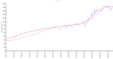
Savannah at Riverside vs Coral Springs