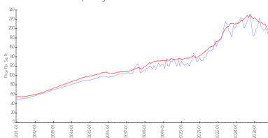
Suffolk at Century Village (A-O) vs Pembroke Pines