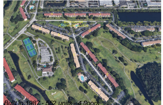
Built in 1987 - 552 units - 2nd floors