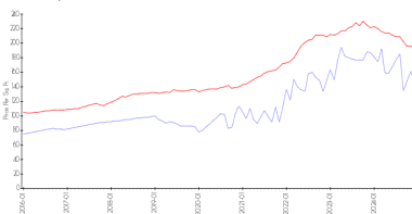
Hollybrook Golf & Tennis Club 24-52 vs Pembroke Pines