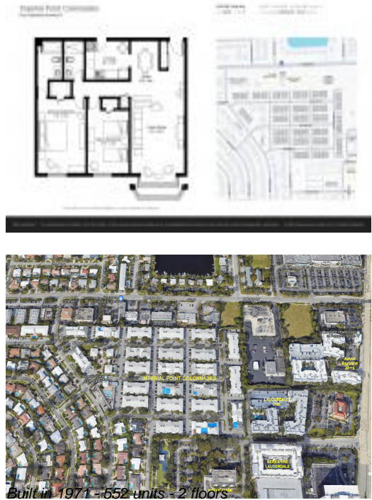
Built in 1971 - 552 units - 2 floors