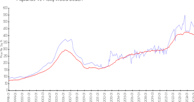
Aquarius vs Hollywood Beach