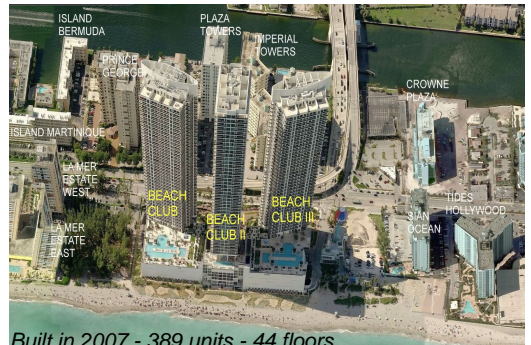
Built in 2007 - 389 units - 44 floors