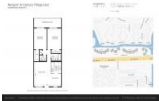
Built in 1974/1978 - 796 units - 2 floors

The above valuated price is a baseline figure that does not take into account any specific renovation, upgrade, split, merge, or deterioration of the unit.