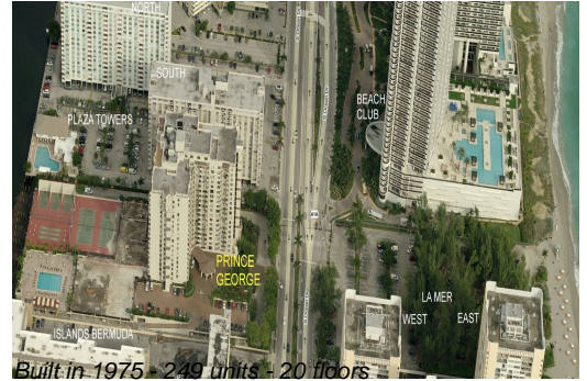
Built in 1975 - 249 units - 20 floors