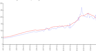
Cambridge at Century Village II & III vs Pembroke Pines