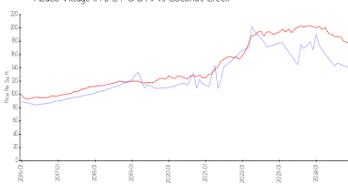
Abaco Village (A B C F G & H) vs Coconut Creek