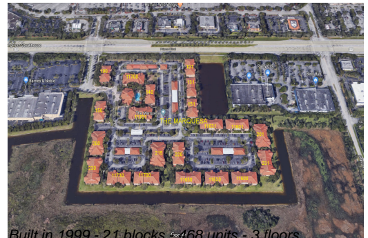
Built in 1999 - 21 blocks ~468 units - 3 floors