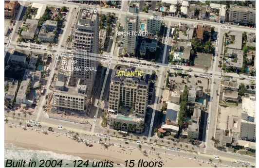
Built in 2004 - 124 units - 15 floors

The above valuated price is a baseline figure that does not take into account any specific renovation, upgrade, split, merge, or deterioration of the unit.