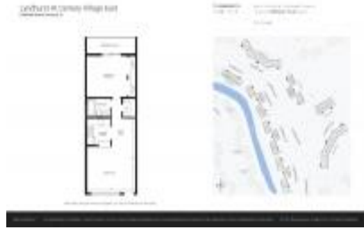
Built in 1974/1977 - 480 units - 4 floors

The above valuated price is a baseline figure that does not take into account any specific renovation, upgrade, split, merge, or deterioration of the unit.