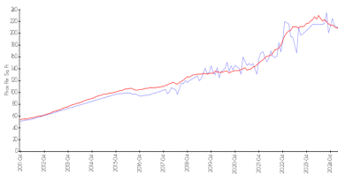
Hawthorne at Century Village vs Pembroke Pines