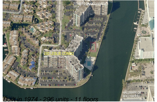
Built in: 1974 - 296 units - 11 floors