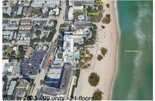
Built in 2023 - 99 units - 21 floors