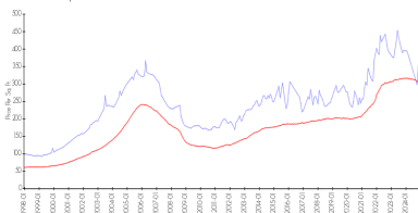
Hemispheres Ocean South vs Hallandale Beach