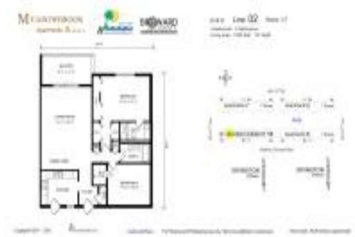
Built in 1973 - 56 units - 7 floors

The above valuated price is a baseline figure that does not take into account any specific renovation, upgrade, split, merge, or deterioration of the unit.