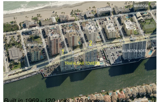
Built in 1969 - 120 units - 16 floors