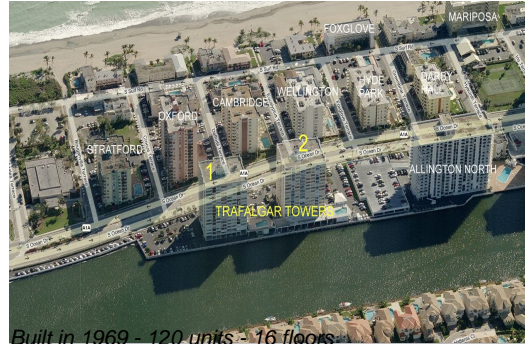
Built in 1969 - 120 units - 16 floors