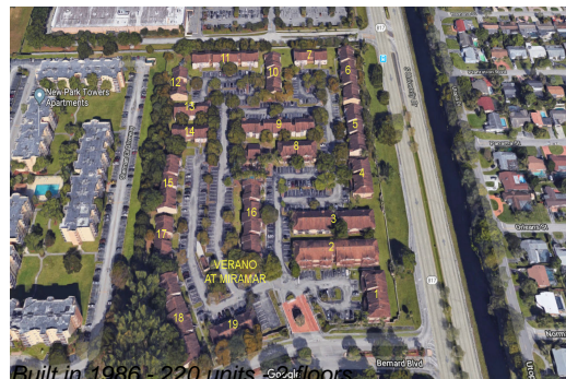
Built in 1986 - 220 units, 802 sq. ft.