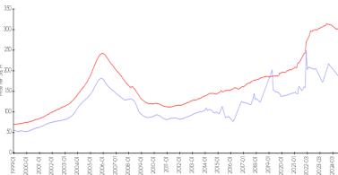
Palm Aire 61 vs Pompano Beach