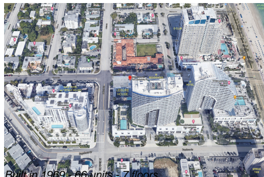
Built in 1969 - 66 units - 7 floors